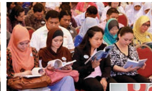
■ KHUSYUK..Para tetamu yang hadir berhenti seketika untuk 10 minit membaca buku sebagai tanda sokongan terhadap program ini.