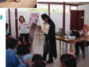
Program Sudut Lincoln : Sesi bercerita dengan kanak-kanak di Perpustakaan Desa Nanga Dap, Kanowit