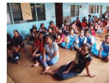
Program Literasi Maklumat Perpustakaan Desa Nanga, Rumah Panjang Bennet Ringgit Kanowit

Unit Perkhidmatan Komuniti Pustaka Negeri Sarawak dengan jayanya telah menganjurkan program Jangkauan Ilmu untuk komuniti luar bandar dengan berkongsi ilmu mengenai program Born To Read, program Literasi Maklumat, program bercerita, aktiviti kanak-kanak dan juga program tayangan video Sudut Lincoln. Pada 12-15 Mac 2014 yang lalu, Program Jangkauan Ilmu telah diadakan di beberapa buah tempat seperti Perpustakaan Desa Nanga Dap (USP5) Kanowit, Rumah Panjang Bennet Ringgit, Perpustakaan Desa Tada (USP5) Kanowit, Perpustakaan Desa Ixora Indah Kapit dan Perpustakaan Desa Sungai Asap Belaga Kapit. Program ini telah disertai oleh kira-kira 403 pelajar, kanak-kanak dan penduduk luar bandar Nanga Dap, Nanga Tada, Sungai Asap Belaga dan Kapit Ixora Indah.