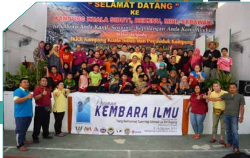
■ Jawatankuasa Kembara Ilmu 2015 bersama komuniti di Kuala Sibuti.