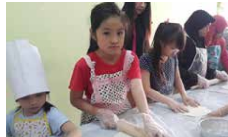
■ Si cilik yang mengambil bahagian dalam Bengkel Membuat Pizza