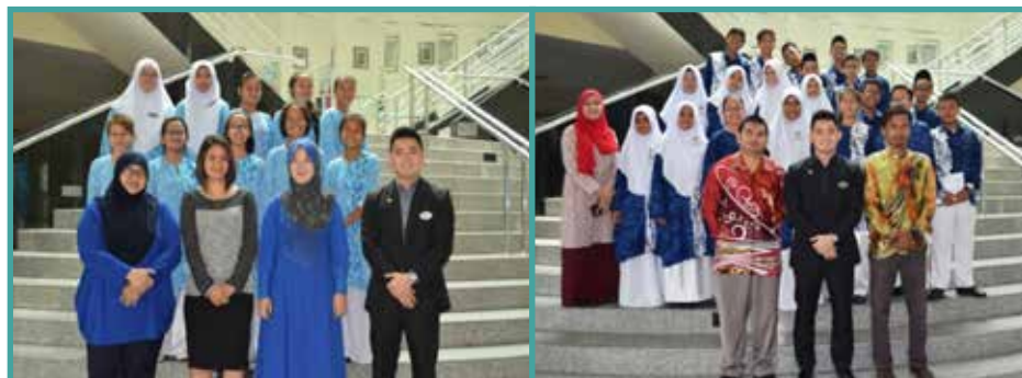
■ Pelajar Tingkatan 3, Sekolah Menengah Sekitar Bandaraya Miri