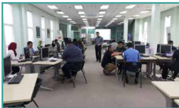
■ Staf Pustaka Negeri Sarawak, Miri