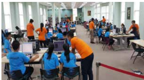
■ LEARNING... The participants being guided by facilitators during the information literacy skills session.

MIRI – A total of 35 students had the time of their lives learning and having educational fun when they participated in Pustaka Negeri Sarawak, Miri's Knowledge Camp 2016 held recently (11 – 12 March 2016).