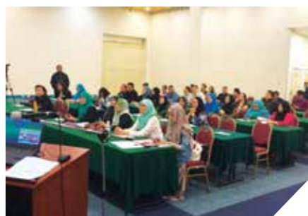
■ Peserta sumbangsaran PPM 2016

Pada sesi sumbangsaran berkenaan isu-isu berkaitan pembangunan bidang kepustakawanan di Malaysia telah dibincangkan. Perkembangan bidang ini di negara Filipina dan Indonesia yang jauh lebih maju berbanding Malaysia telah diketengahkan. Semua pustakawan digesa mendaftar menjadi ahli PPM bagi menguatkan persatuan supaya lebih mudah untuk memperjuangkan isu-isu untuk kepentingan bersama.