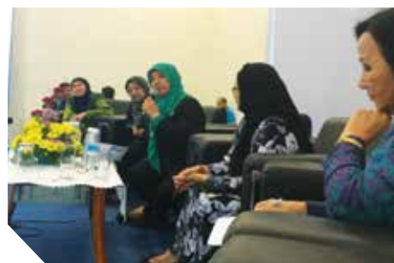
■ Ahli-ahli panel sumbangsaran