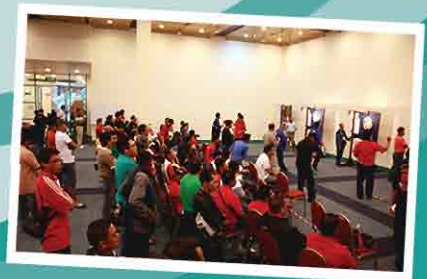
Penonton sedang asyik menonton kehebatan pemain-pemain dart