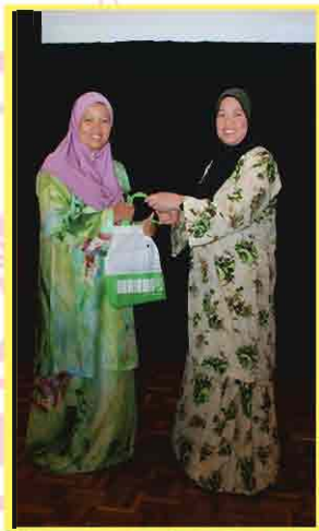
Penyampaian cenderamata dari pihak Pustaka kepada penceramah