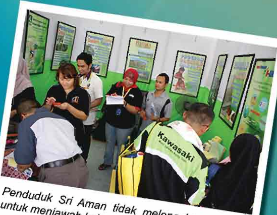
Penduduk Sri Aman tidak melepaskan peluang untuk menjawab kuiz yang disediakan

Pustaka Negeri Sarawak telah menyertai Jerayawara Pameran Sejiwa Senada anjuran Unit Pemantauan Pelaksanaan Negeri (SIMU), Jabatan Ketua Menteri yang diadakan di Sri Aman (25-27 Feb 2011), Serian (18-20 Mac 2011) dan Kuching Selatan (25-27 Mac 2011).