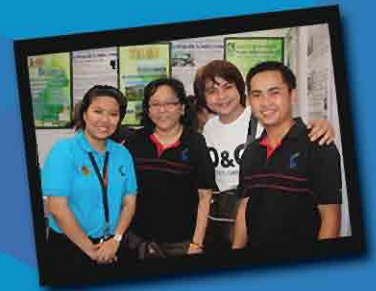
PENGUNJUNG ISTIMEWA... Saiful Malaysian Idol (dua kanan) turut berkunjung ke gerai Pustaka.