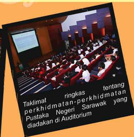
Taklimat ringkas tentang perkhidmatan-perkhidmatan Pustaka Negeri Sarawak yang diadakan di Auditorium

Jawatankuasa Teknikal Catur MSS Bahagian Kuching, MSSR Pejabat Daerah Padawan, Jabatan Pelajaran Negeri Sarawak dengan kerjasama Pustaka Negeri Sarawak telah mengadakan Kejohanan Catur Individu Dalam Pasukan MSS Bahagian Kuching 2011 pada 2 dan 3 Mac 2011 jam 7.00 pagi hingga 5.00 petang bertempat di Galeri, Pustaka Negeri Sarawak. Pada jam 8.00 – 9.00 pagi, pelajar telah diberi taklimat ringkas tentang perkhidmatan dan lawatan ke sekitar Pustaka Negeri Sarawak. Objektif kejohanan adalah untuk mengenalpasti pemain-pemain catur 12, 13 dan 18 tahun ke bawah yang berkebolehan dan berpotensi bagi membentuk sebuah pasukan catur MSS Bahagian Kuching yang mantap sebagai persediaan menghadapi Kejohanan Catur Peringkat Negeri Sarawak yang akan berlangsung di Bahagian Limbang pada 3-5 Mei 2011. Dengan adanya usaha sama sebegini akan menjadi aktiviti serampang dua mata iaitu di samping menyertai pertandingan catur peserta juga dapat mengenali dan memahami fungsi serta peranan Pustaka Negeri Sarawak.