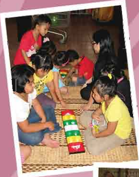
HAVING FUN...Children trying their hands on playing the traditional game of 'congkak'.