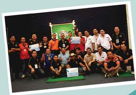
Gambar kenang-kenangan bersama pemain-pemain dart

Objektif pertandingan ini adalah bagi mengeratkan hubungan siratulrahim antara pemain-pemain dart selain memperkenalkan Pustaka sebagai pusat penyampaian ilmu dan maklumat. Pertandingan tersebut telah dimenangi oleh pasukan SG Darters yang membawa pulang wang tunai sebanyak RM 2000.00 berserta piala manakala tempat kedua, dimenangi oleh pasukan Jabatan Hutan Negeri Sarawak yang membawa pulang wang tunai RM 1000.00 berserta piala dan tempat ketiga, dimenangi bersama pasukan Bulls Bros dan S. Alpha yang masing-masing membawa balik wang tunai RM 500.00 berserta piala.