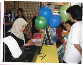
MEMBERSHIP DRIVE...Crowd throngs the Customers' Day counter to register

MIRI ... Pustaka Miri is continuing its effort in reaching out to the community with more lifelong learning and knowledge-sharing activities this year.