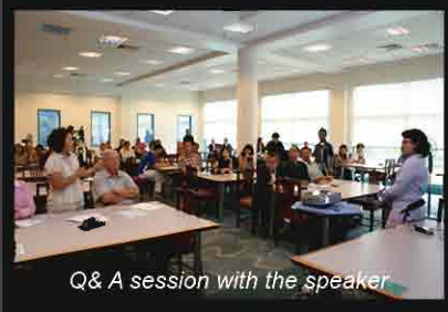
Q&A session with the speaker