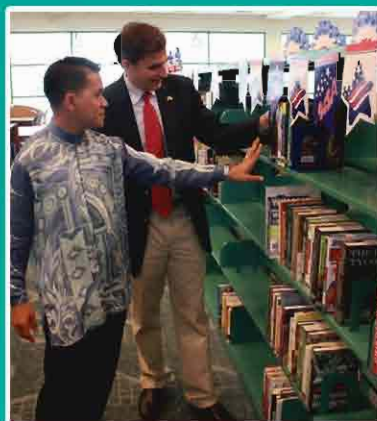
It's a cyber world but...books, they're here to stay.