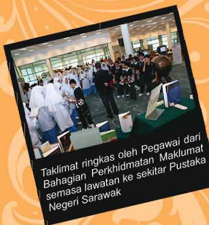
Taklimat ringkas oleh Pegawai dari Bahagian Perkhidmatan Maklumat semasa lawatan ke sekitar Pustaka Negeri Sarawak