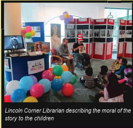
Lincoln Corner Librarian describing the moral of the story to the children