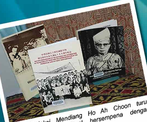
Buku Koleksi Mendiang Ho Ah Choon turut dipamerkan dan dijual bersempena dengan Pameran Sejiwa Senada di MBKS

Selain pengunjung-pengunjung yang berbilang bangsa dan umur, kami juga mendapat informasi dan maklumat tambahan apabila berpeluang melawat ke lebih 180 buah tapak pameran dari pelbagai agensi di Sarawak serta ianya juga dapat mengeratkan lagi hubungan di antara jabatan.