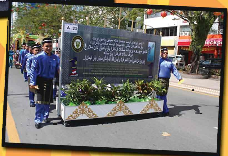
PUJI-PUJIAN KE ATAS RASULULLAH S.A.W ... Kontinjen sedang melalui Jalan North Yu Seng menuju kembali ke Dewan Suarah Miri.