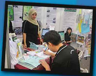
JAWAB JANGAN TAK JAWAB... Seorang pengunjung sedang menjawab Uji Minda Pustaka.

Pasukan Pustaka telah mempromosikan perkhidmatan dan kemudahan yang disediakan di Pustaka Negeri Sarawak dan Pustaka Miri selain menjual siri Sarawakiana dan kuiz yang diadakan.