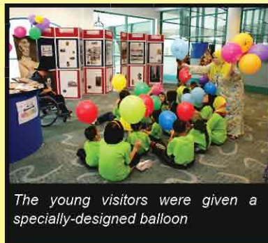
The young visitors were given a specially-designed balloon

On 11 February 2011, 35 students and teachers from Taska Rumah Kanak-Kanak Kuching visited Pustaka Negeri Sarawak. A librarian gave them a brief presentation on children activities, collections and services. In addition to this, a guided tour of the library and briefing on American Presidents via exhibition was also included in the visit.