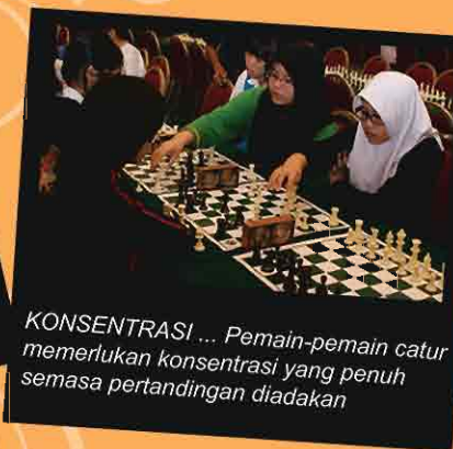
KONSENTRASI ... Pemain-pemain catur memerlukan konsentrasi yang penuh semasa pertandingan diadakan