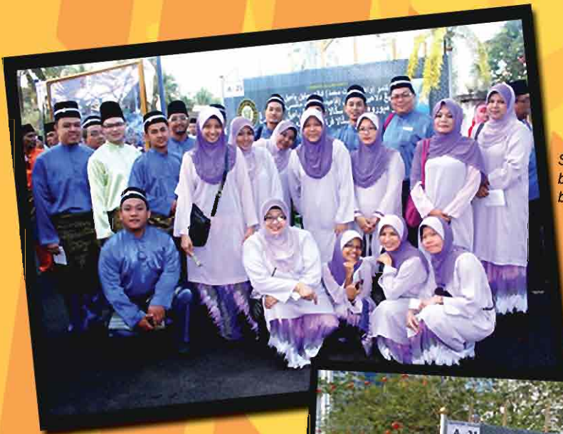
SEMANGAT UKHWAH ... Kontinjen Pustaka Miri bergambar kenang-kenangan sebelum perarakan bermula.

Perhimpunan telah berlangsung di perkarangan Dewan Suarah Miri sebelum perarakan bermula. Perarakan tahun ini telah melalui beberapa jalan utama Bandaraya Miri sebelum berakhir di tapak permulaan.