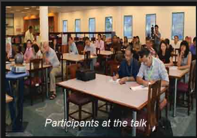
Participants at the talk