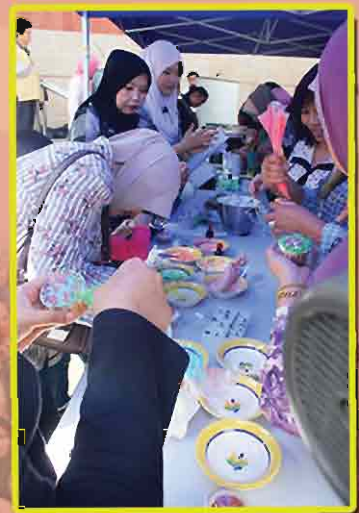
HANDS ON...Some of the participants showing off their decorating skills

Participants can use the knowledge learnt to start their own cupcake business from home or just as a hobby and make cupcakes for family and friends.