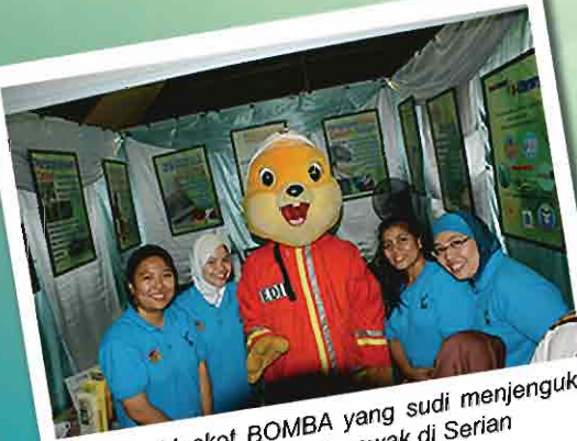
"Mr Edi" Maskot BOMBA yang sudi menjenguk "booth" Pustaka Negeri Sarawak di Serian