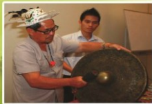
THIS IS THE CORRECT WAY... Temenggong Pahang Ding Anyi showing the proper techniques of beating the gong during the Cultural Forum: Burial Ritual of the Orang Ulu According to Castes.