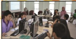
USEFUL TIPS...The participants learning simple techniques in creating their own blogs.