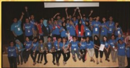
TOGETHERNESS...The participants with their mentors and facilitators at the closing ceremony.