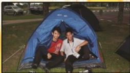
CAMPING AT THE LIBRARY...Once a year, Pustaka Miri becomes camping ground for Knowledge Camp. This year, the venue was in the front courtyard of the library.