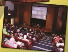
Para jemputan memberi perhatian dengan sepenuhnya.