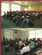
Para peserta yang sedang mendengar penyampaian sesi forum

Sesi ini juga diadakan bertujuan untuk mempromosikan Pustaka Negeri Sarawak sebagai sebuah gedung ilmu dan memberikan kesedaran kepada golongan bella mengenai betapa pentingnya perkongsian maklumat.