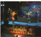
PRESERVING CULTURE... Team Duyung Bersiram showing how it is done during Bermukim Competition.