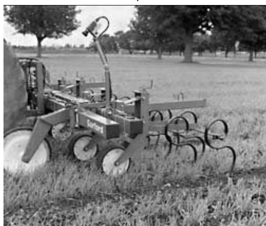
Figure 1 Computer-guided hoe for weeding uses video camera to steer between crop rows

beet crops, which have much less prominent features than cereal crops.