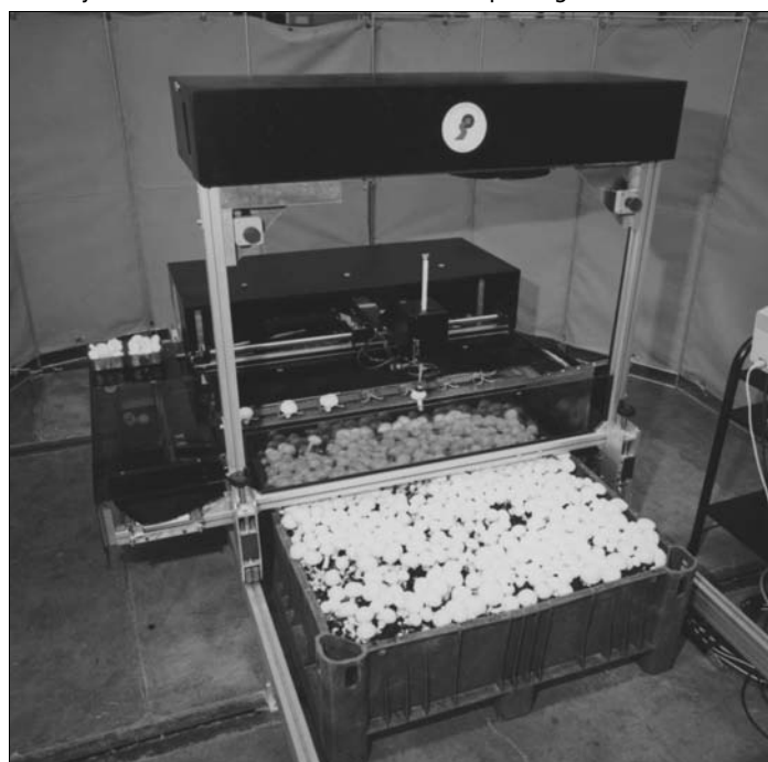
Plate 1 Automatic harvesting robot detects suitable mushrooms, picks them by bend and twist, trims and delivers to packing

picks up the mushroom and transfers it to a finger conveyor which individually transfers the mushrooms to a special high-speed trimmer and thence to a gripper transfer station for packing.