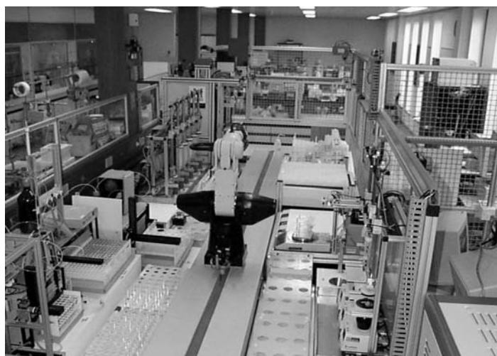
Figure 5 Automated sample analysis line at Rhône-Poulenc Agriculture has 21 workstations and a 6-axis CRS robot