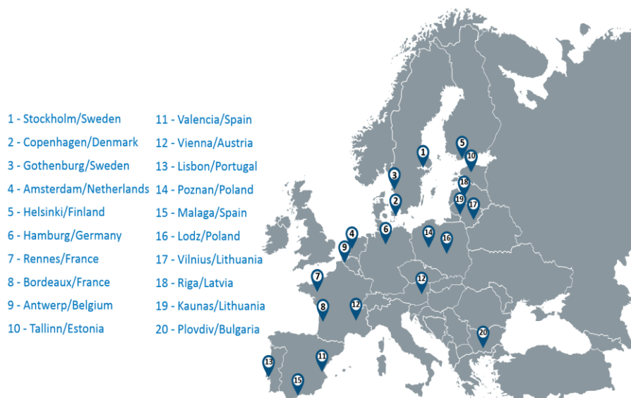
FIGURE 2 - THE MAP OF SMART EUROPEAN CITIES WHICH INTEGRATE BIOENERGY IN CONSUMPTION Source: the authors

The map represents an element of novelty brought by this paper. The numbering of cities on the map is not accidental, it takes into account the average value of the smart city index (Vienna University of Technology, 2015). It represents a first trial of gathering smart cities that started using bioenergy. We are convinced that there are other big smart cities that could have been included on the map and that, unwillingly, we didn't pay attention to. The map may be enriched with other examples of cities as they direct their consumption to this type of energy.