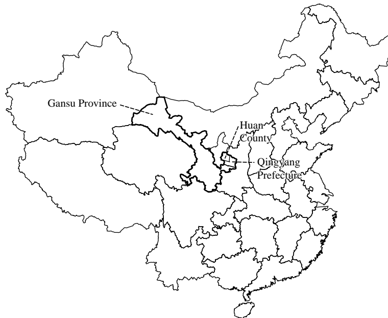
Figure 1. Map of Gansu province, Qingyang prefecture and Huan county

The widespread nature of the forage-ruminant livestock push across the semi-pastoral/agricultural areas[2] of Northern and Western China – from Yili prefecture in the far West of Xinjiang to Chifeng city prefecture in Eastern Inner Mongolia, and with numerous prefectures such as Qingyang in between – warrants a critical review of these developments. The following section overviews previous integrated forage-livestock industry development in Qingyang, while Section 2 sets out the policy framework for the current industry development. Although there is widespread support for promoting integrated forage-livestock systems, translating the intentions into outcomes is compromised by disconnects between government agencies, government and households, and households and the market. The nature of these disconnects and the means of resolving them are discussed in turn in Sections 3-5.