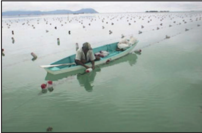
Figure 6: The small wooden type boat locally named as 'Bogo-bogo' in Semporna.