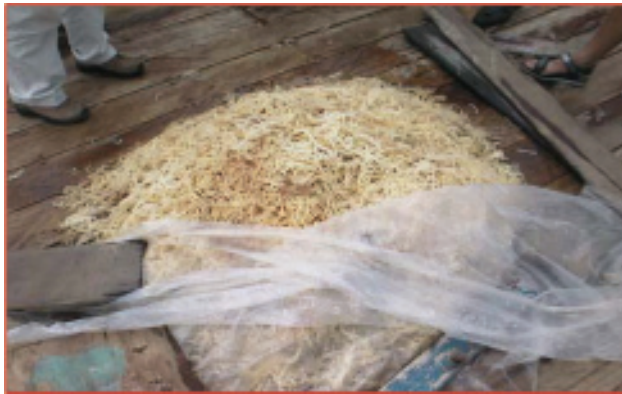
Figure 9: Producing the 'whitish dried seaweed' that could fetch a better price.

local people that eating this seaweed may give a good health due to its micronutrients properties.