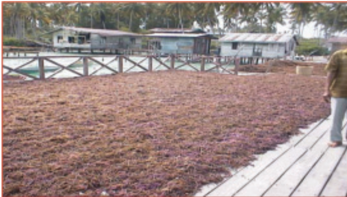
Figure 7: Drying of seaweed on the wooden platform.

There are two types of drying method, which has been practiced widely in Sabah; these are the platform method (Figure 7) and hanging method (Figure 8). The platform method is usually made of three different type of material such as wood, cement or bamboo material is commonly being employed. Basically the drying process will take between 3-5 days and up to 7 days during the dry season and raining season, respectively.