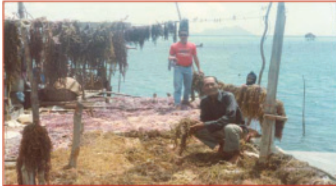
Figure 8: Drying of seaweed by using hanging method.