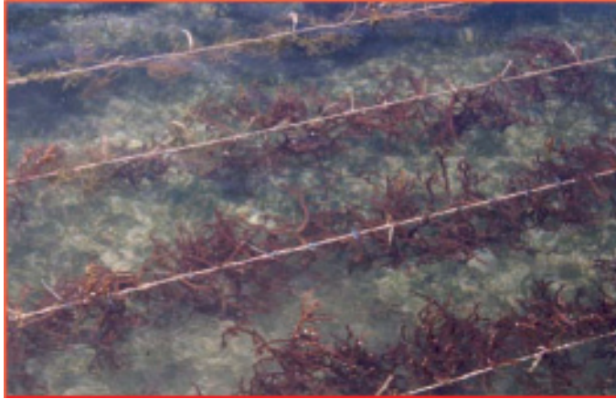
Figure 2: Stake cultivation system widely being practiced in shallow water.

during low tide and 1.5m during high tide (Figure 2). This system can accommodate a total of 14,500 to 15,000 seedlings per acre. Production cost for this system is approximately $MR1,800 per acre and consider as the most expensive system compared to Long Line and Raft Systems. This could be due to the material involved such as hard type wooden stake (e.g mangrove or 'Belian' wood stakes), rope and line, and plastic floater.