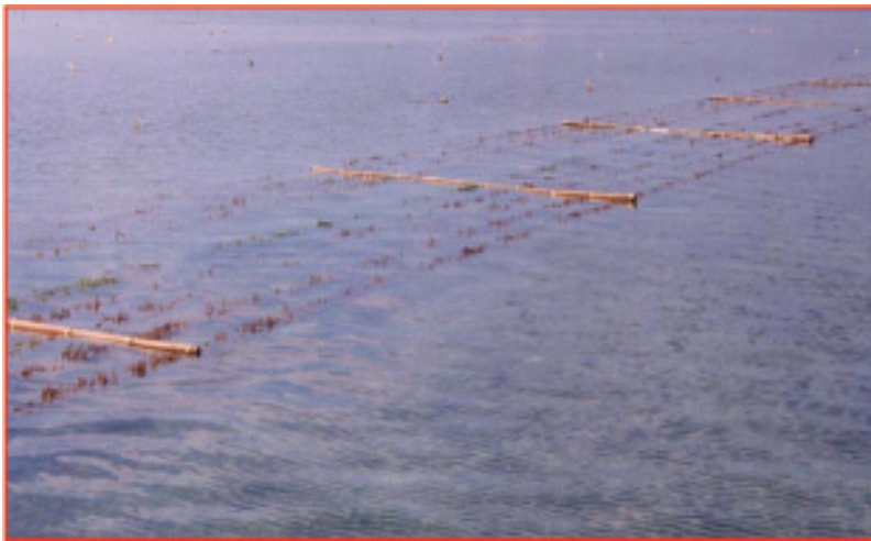
Figure 4: Raft cultivation system mainly being practiced in the deeper water.

In practical, seaweed is ready to be harvested in 1.5 to 2 months period of time (Figure 5). However some areas particularly in certain village in Semporna has shorter period of cultivation (1-1.5 months). The small wooden boat or locally named as 'Bogo-bogo' in Semporna is being used widely not only during planting, but also during maintaining of farm and harvesting (Figure 6). Fiberglass boat equipped with 15HP out boat engine also being employed, particularly in the area where the farm site is located far from they mainland. It is also being used as a mother-boat to transport larger quantity of wet seaweed from the farm to the drying platform.