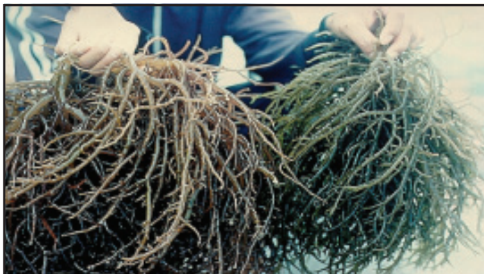
Figure 5: Bunches of seaweed ready to be harvested.