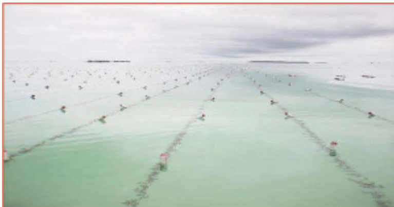
Figure 3: Long lines cultivation system.

Long line system found to be suitable for area with 2m-5m water depth (Figure 3). A total of 6,500 to 9,500 seedlings per acre can be cultured through this system or approximately 21 lines (300 feet per line) per acre. Practically, around 300-450 seedlings per line depending on the size of each seed. The cost of production by employing this system is consider the cheapest system which is around $MR600 per acre. This system was firstly introduced in 1992 in Semporna and it becomes the most popular system and being practiced almost 95 % of seaweed farmer in Sabah. This mainly due to cheaper cost of production and practically easier for installation and maintenance.